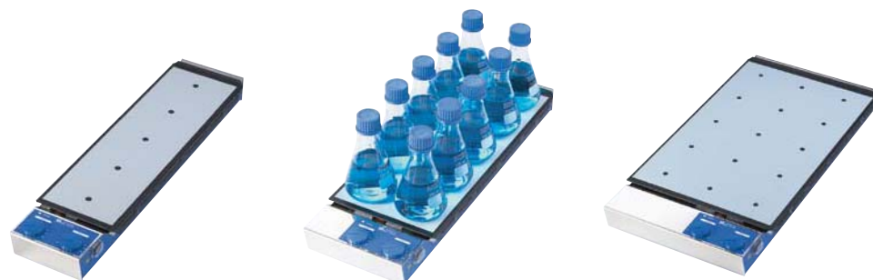
| RT 5 power

Multi-position magnetic stirrers with heating