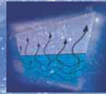
Degas and Autodegas

The Elmasonic S ultrasonic units offer practically every available technical feature. Now the units of the new series increase the ultrasonic effect further to obtain even better results.