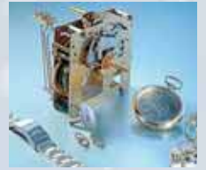
Ultrasound in the watchmaker branch

■ Laboratory: Ultrasound cleans wherever the cleaning liquid can go. It is particularly suitable for the cleaning of laboratory instruments made of glass, plastic or metal. Elmasonic S units degass HPLC solutions, mix, disperse, emulsify and dissolve specimens.