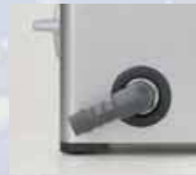
Positioned drain duct