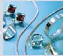
Ultrasonic cleaning in the jewellery branch