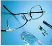
Ultrasound for ophthalmology and opticians