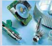
Cleaning of items in industry, workshops and service