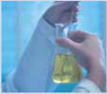
Cleaning, degassing and dispersing in the lab