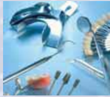
Cleaning in the dental and medical sectors