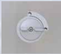
Knob for drain on side

The Elmasonic S units are available in 13 different sizes, ranging from 0.5 liter (approx. 0.1 gal or 0.5 quart) up to 90 liter (approx. 24 gal). They are equipped with efficient 37 kHz ultrasonic high-performance transducers of the latest generation.