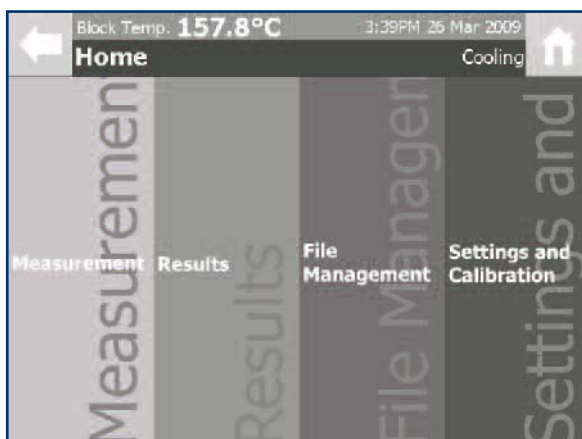
SMP40 Interface - Homepage