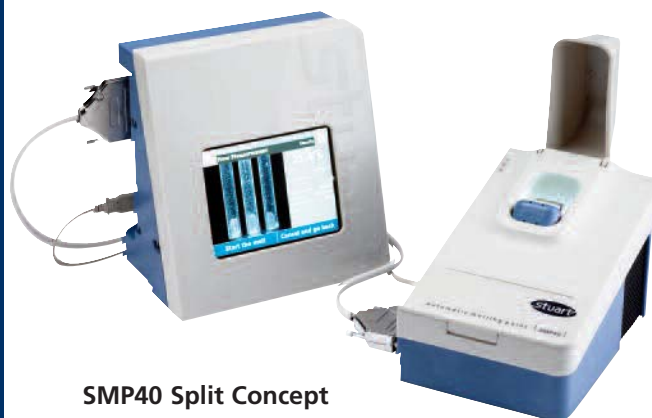
SMP40 Split Concept