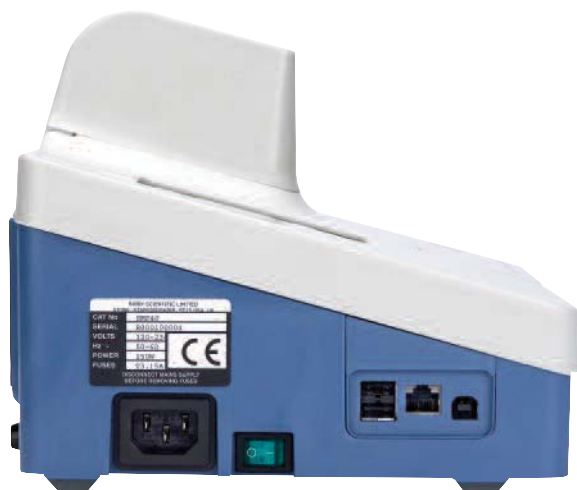
SMP40 Side Profile