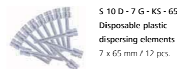
S 10 D - 7 G - KS - 65 Disposable plastic dispersing elements 7 x 65 mm / 12 pcs.