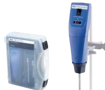
Package incl. storage case and dispersing elements, without stand