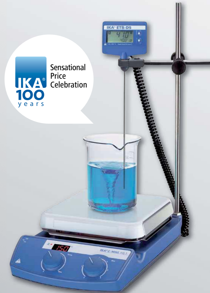
C-MAG HS 7 IKAMAG® Package 503,00 €