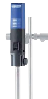
Package without stand and clamps